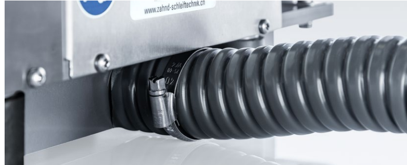
■ Suction nozzle for industrial vacuum cleaner

With the EVO4, maximum user-friendliness and health protection are top priorities.