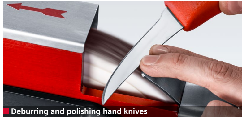
■ Deburring and polishing hand knives

The FP02 is characterized by its compact design and outstanding performance. Double-sided grinding in a single operation guarantees high productivity and reliably ensures that knives are quickly ready for use again.