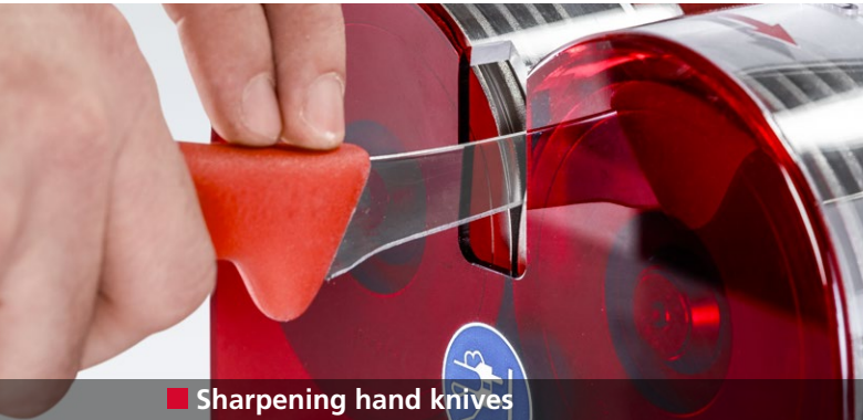
■ Sharpening hand knives

Perfectly designed for maximum user-friendliness